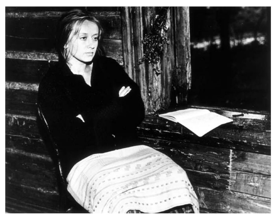
A still from 'Mirror' by Andrei Tarkovsky (Zerkalo [Mirror] (1974).)

Editing is ultimately no more than the ideal variant of the assembly of the shots, necessarily contained within the material that has been put on to the roll of film.