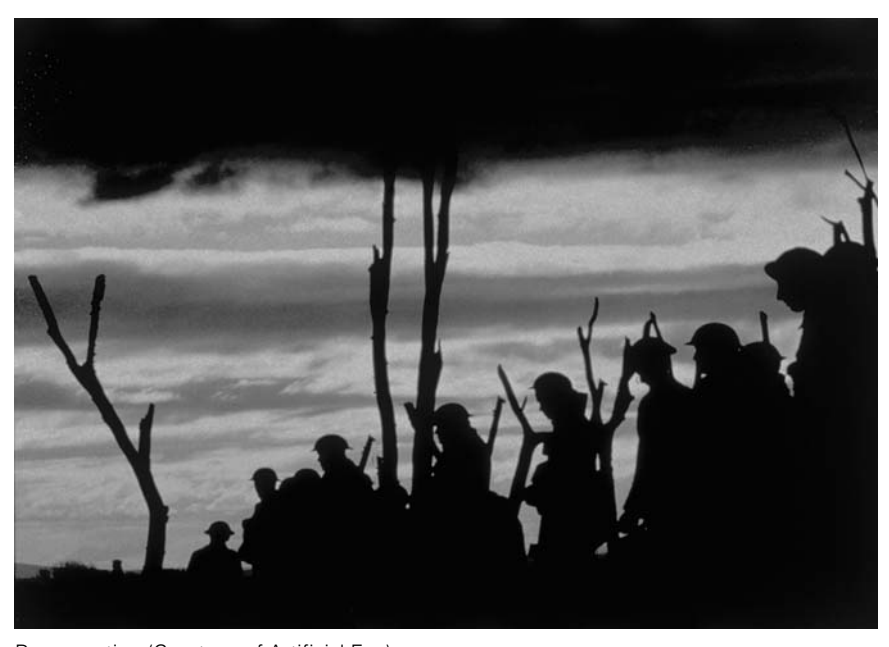
Regeneration

I was born in Toronto to Italian parents. My father was a dental technician and my mother raised five girls. She stayed home until we were all off at school. My mother loves entertainment, theatre