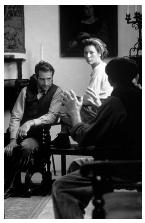
Still from the above scene in 'Land and Freedom'