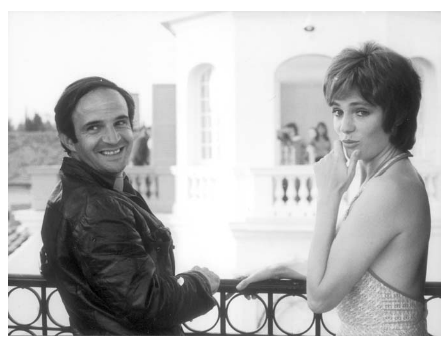
François Truffaut and Jacqueline Bisset during the shooting of 'La Nuit américaine' ('Day for Night')

Editing is a very creative period because, as a rule, you can't afford to blunder. A film can get ruined in the editing, but generally you do it a lot of good. One of the montages I regret is that of 'Two English Girls' because I edited it as if the film had turned out rather well. I did an optimistic montage that I regretted later, because the film