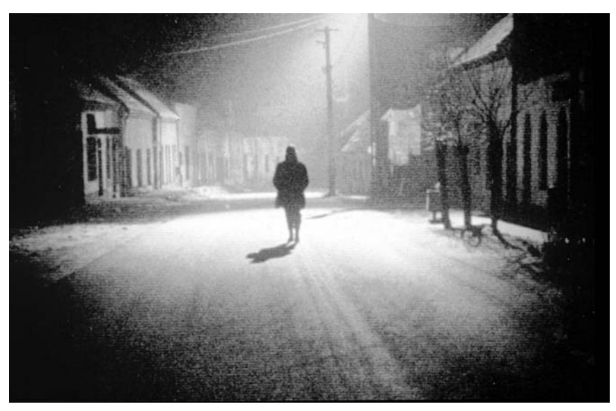
'Werckmeister Harmonies' a film by Béla Tarr

have their faces and they are important, they play an important role in the story'.