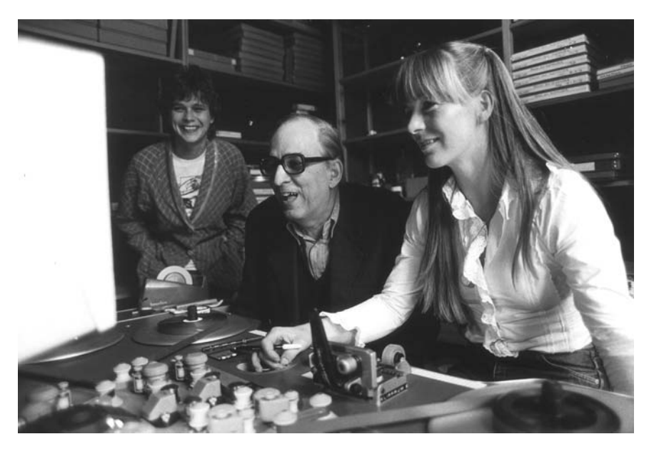
Sylvia Ingemarsson cutting with Ingmar Bergman

I was employed from the first day of shooting in Norway, but he never wants to edit during the shoot. I collected the material and