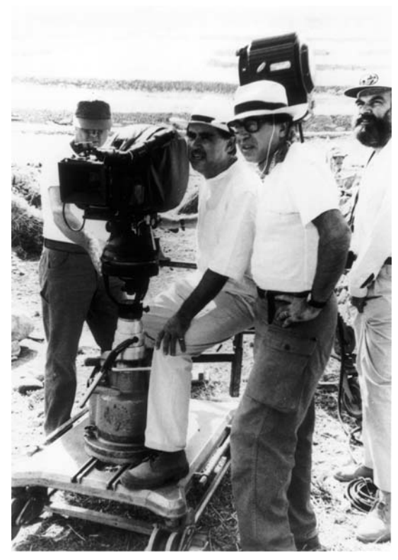
The Taviani Brothers during the shoot of 'Kaos'

Back then "Padre Padrone" was a provocation. It has been difficult to sustain that quality but the new film, which is extremely long feels like we have found our old fluency.