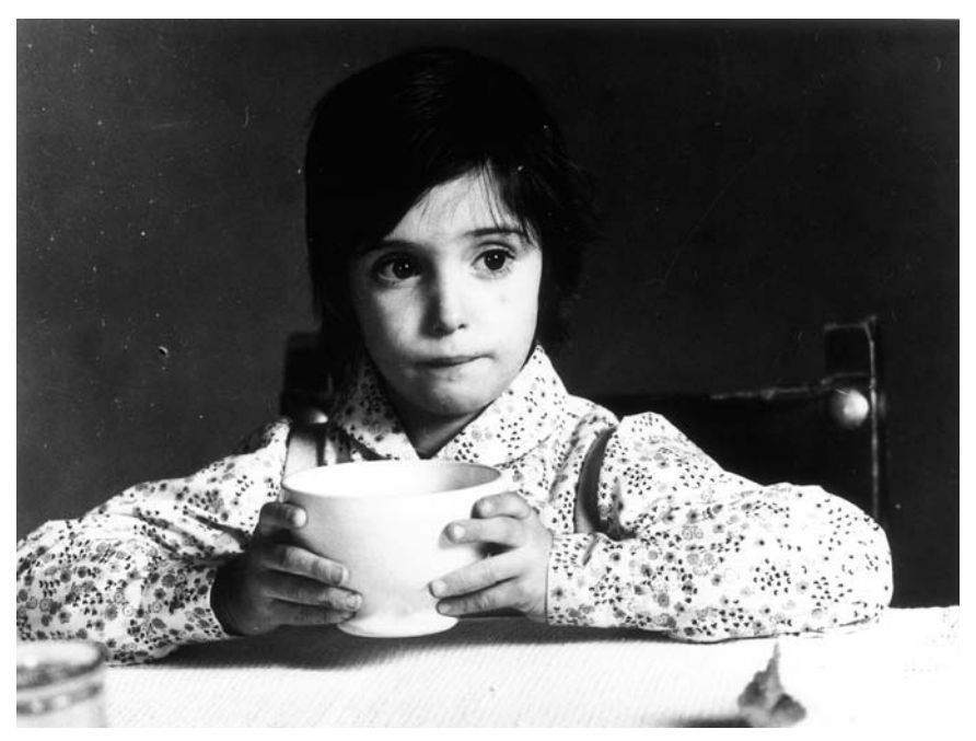
Ana Torrent the magical child in 'Spirit of the Beehive' by Victor Erice

not to explain (predetermine) everything allows one to work from the point of view of the spectator and to resist answering all questions.