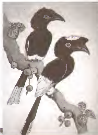
Black and White Casqued Hornbills